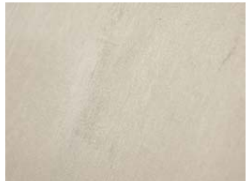
A matt grey is left on annealed mill products following descaling and pickling. Mechanical scale loosening roughens the surface.