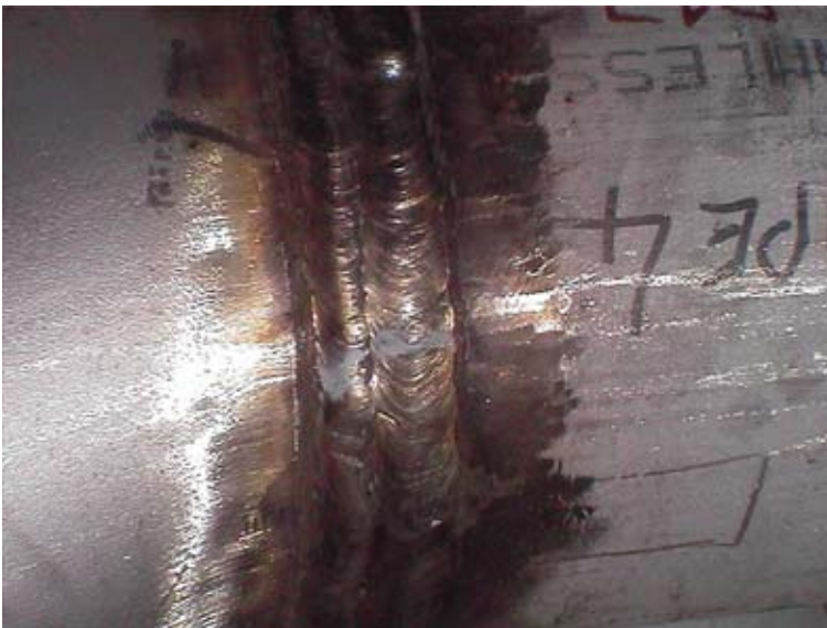
Welded stainless part in the "as welded" condition: the oxide scale is likely to give way to corrosion if not properly removed.

As heat tints are formed on the surface of stainless steel chromium is drawn to the surface of the steel, as chromium oxidises more readily than the iron in the steel. This leaves a layer at and just below the surface with a lower chromium level than in the bulk of the steel, and so a surface with reduced corrosion resistance.