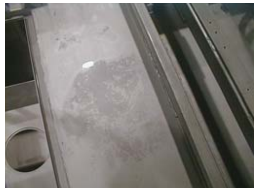
Patchy, uneven pickled surfaces can result if surfaces are not clean before the acid treatment.

If stainless parts are contaminated with grease or oil, then a cleaning operation prior to acid treatment should be carried out.