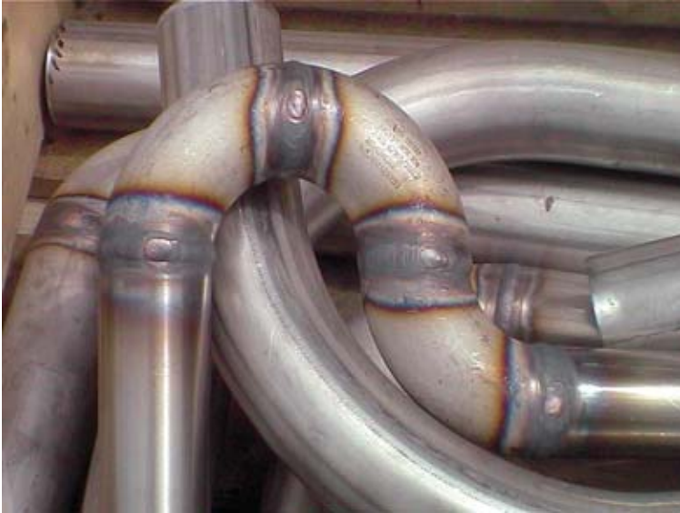
Light scaling left on weld caps and heat tint on the surrounding parent tube surfaces can usually be removed by acid pickling.