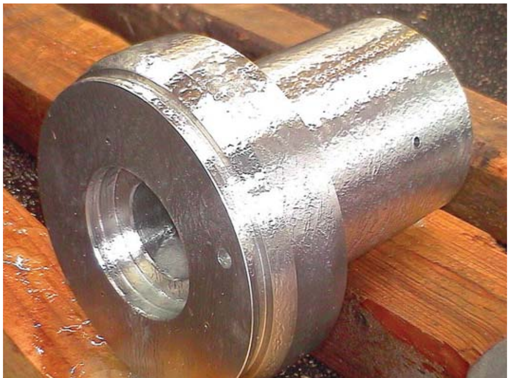
Small stainless steel parts can be effectively pickled with brush-on gel.

stainless steels can vary. It is important that the operators are aware of the specific grade of steel being pickled and the hazards of the products being used, so that safe, satisfactory results can be obtained. It is important that all traces of pickling products, pickle residues and contamination are completely rinsed from the surface of the steel parts to achieve a fully corrosion resistant and stain free surface. Competent stainless steel cleaning and restoration specialists normally use de-ionised (distilled) water for final rinsing to get the best results on architectural metalwork. Your nearest national stainless steel development association should be able to advise on pickling product and pickling service suppliers locally available.