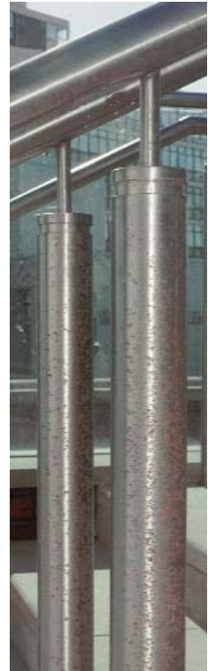
Rusting of iron contamination during the service life of stainless steel is unsightly. Removal can be time-consuming and expensive.

Your nearest national stainless steel development association should be able to advise on companies specialising on the removal of iron contamination and general restoration and cleaning of architectural fabrications.