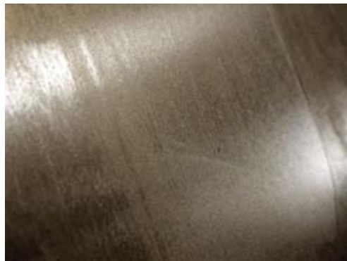
Stainless steel surfaces form a grey/black scale during hot rolling or forming. This tenacious oxide scale is removed in the steelmill by descaling.

Pickling is the removal of a thin layer of metal from the surface of the stainless steel. Mixtures of nitric and hydrofluoric acids are usually used for pickling stainless steels. Pickling is the process used to remove weld heat tinted layers from the surface of stainless steel fabrications, where the steel's surface chromium level has been reduced.