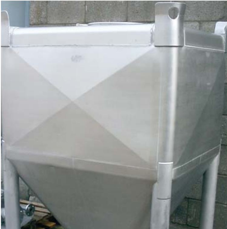
After cleaning, pickling and passivation treatments a sound and consistent finish is produced. This looks good and gives a surface with optimum corrosion resistance for the particular stainless steel grade used.

Your nearest national stainless steel development association should be able to advise on companies providing specialist assistance on developing surface finish standards for specific projects.