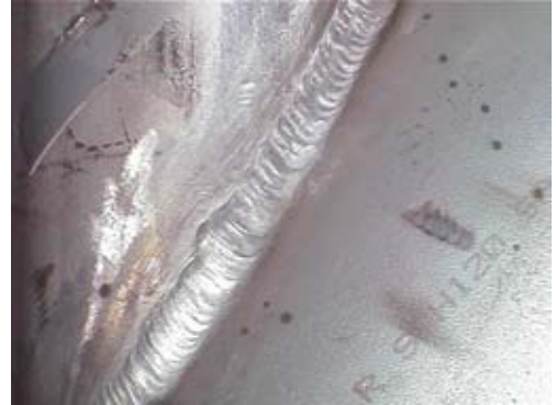
Detail of the welded area after chemical surface treatment: the purpose of this treatment is not to remove the weld seam itself, but the welding tint that accompanies it.

Heat tint is often seen in heat affected areas of welded stainless steel fabrications, even where good gas shielding practice has been used (other weld parameters such as welding speed can affect the degree of heat tint colour formed around the weld bead).